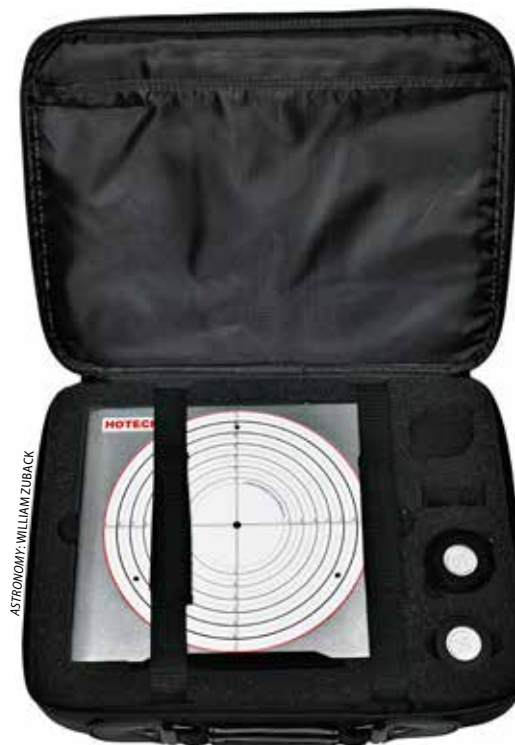
The entire kit fits snugly in a padded carrying case.

First, install the appropriate Reflector Mirror (1¼" or 2") in the back of your SCT. If you intend to use the scope visually, insert