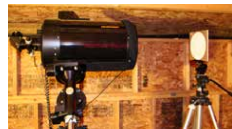
The author photographed his collimating setup.

Wouldn't it be nice to have an easy way to collimate an SCT during the day? Well,