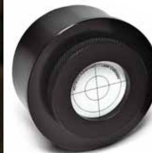
The collimator comes with either HOTECH's 1¼" or 2" Reflector Mirror and an adjustable tripod head.